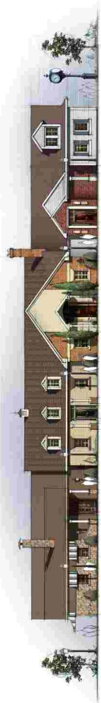
LONG CREEK COMMONS